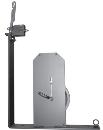
Adjustable Combination Floor Block 600-10818C75A