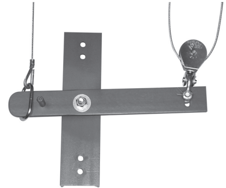
Fire Curtain Arbor Release 016-AR