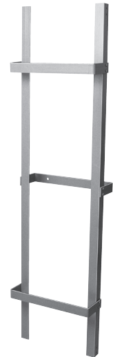
Lattice Track 012-5049R