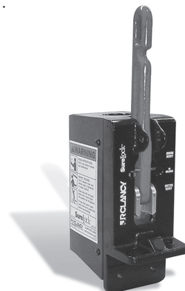
SureLock 010-600R US Patent 7,165,295

Rope locks are not designed to hold an imbalance of more than 50 lbs. (22.6 kg), nor to be used as a speed control.