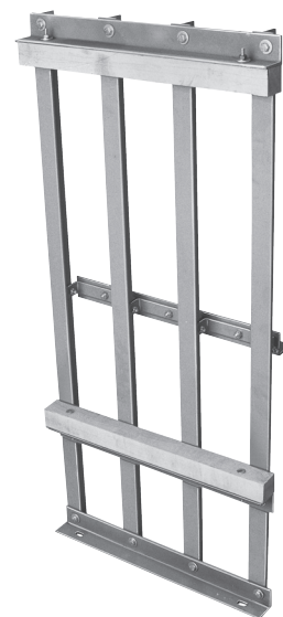
T-Bar Guide System 012-1500